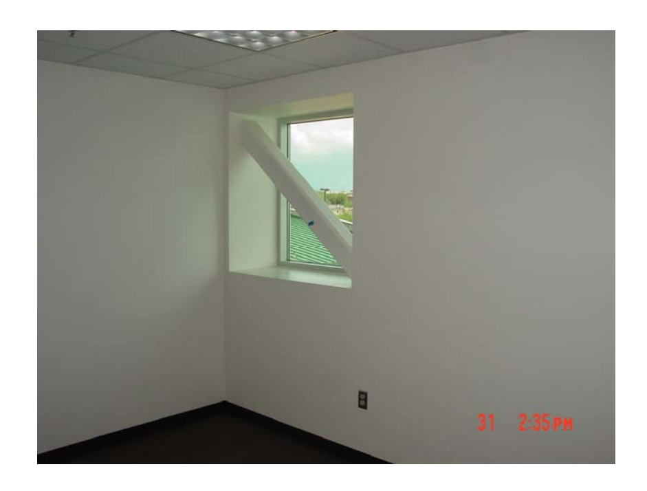
Figure 1. Example of an Improperly Placed Construction Beam

In another instance, as documented in the two photos below, carport roofs were built too low for Border Patrol vehicles to fit under them.