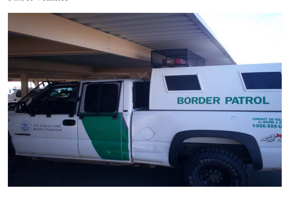
Figure 2. Examples of Carport Roofs Built Too Low for Border Patrol Vehicles

CBP's Construction of Border Patrol Facilities and Acquisition of Vehicles